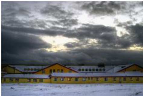
Queen Ingrid's Hospital – Nuuk, Greenland

Covering a geographic area slightly more than three times the size of the state of Texas and with a population of only 56,739* (with approximately 14,000 people living in the capital of Nuuk), Greenland reaps tremendous benefits from their telemedicine program.