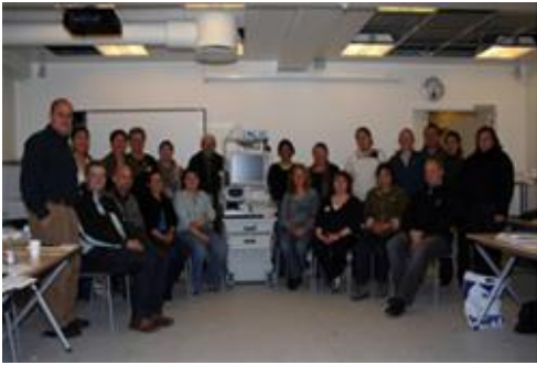
AMD & AFHCAN successfully complete training program in Greenland – September 26, 2008.

Beginning in 2008, Greenland began the process of implementing a Telemedicine Encounter Management System (TEMS™) of its own. The key component of the TEMS™ system in Greenland is the AFHCAN tConsult software. The TEMS™ system also consists of AMD’s Integrated Telemedicine Cart featuring: